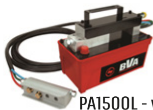
PA1500L - w/ remote