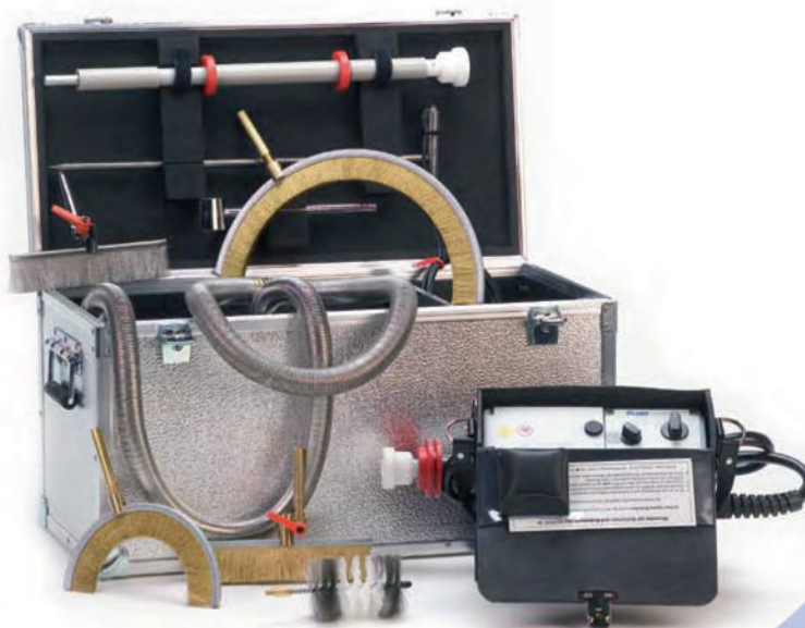
A selection of the wide range of accessories