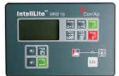
ComAp MRS 16