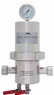
Sterile Filter, type PSF

An advanced solution for CO 2 degassing, yeast aeration and particle-free screening of fermenting yeast.