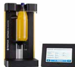
CO 2 -Selector