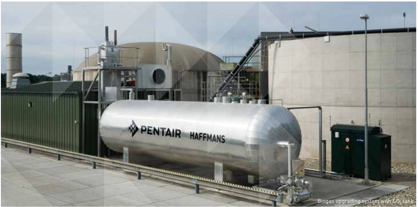
Biogas upgrading system with CO 2 tank