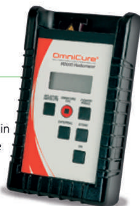
Optional Accessory: OmniCure R2000 Radiometer

Radiometry is an essential link for measuring the light output from a UV curing system in order to maintain a repeatable process. The OmniCure R2000 UV Radiometer can be combined with the OmniCure S1500 UV curing system to provide a complete curing station with unmatched control and repeatability.