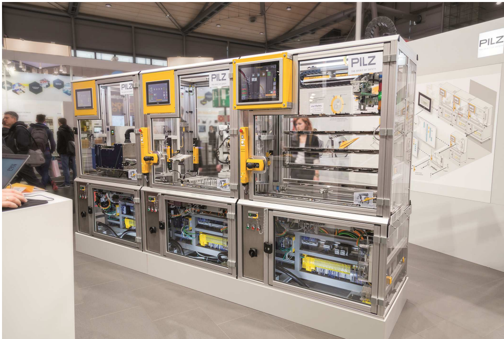
Figure 2: The Pilz Smart Factory demonstrator at Hannover Messe 2016