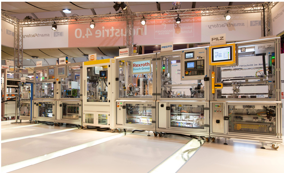
Figure 1: SmartFactory KL at Hannover Messe 2015