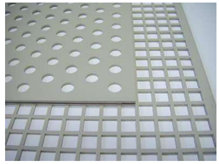
Flexibility: Round and square holes in different sizes and pitches are possible

We offer to you our experience in perforation. From the initial idea to the final specification, we will be your partner with the design offering our advice.