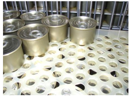
Natural coloured: Polystone® P SSAG is available in natural, grey and special coloures