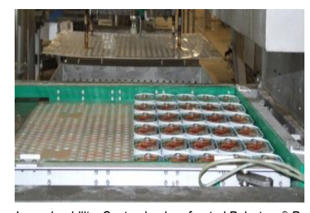
Long durability: Customized perforated Polystone® P SSAG layer pads in a fish canning plant

An embossed surface is recommended for the layer pads with non-perforated areas. They are designed for a vacuum handling system. The embossed surface will prevent the sticking effect due to moisture that could cause taking several layer pads at once.