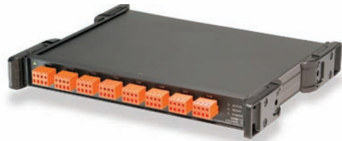
The WBK15 provides up to 8 isolated analog input channels