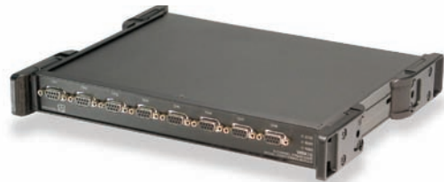
The WBK16 provides eight channels of strain gage input