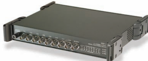
The WBK18 provides a full set of features for making dynamic signal measurements