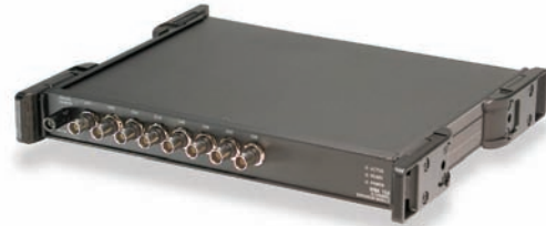
The WBK10A adds eight differential analog inputs