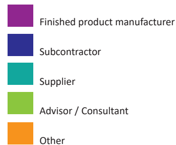
The distribution of readers according to position