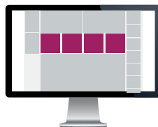
Content banner – Front page Size: 230x230 pixels