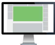
Giga banner – Front page Size: 980x480 pixels