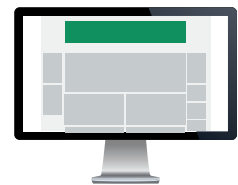
Topbanner Size: 930x180 pixels