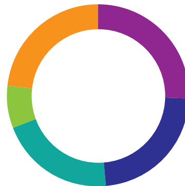
The distribution of readers of the newsletter