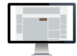
Title banner – Article Size: 930x180 pixels