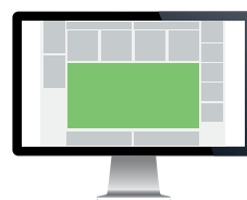
Giga banner – Front page Size: 980x480 pixels