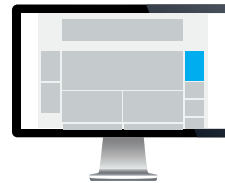
Corner sidebanner Size: 200x300 pixels