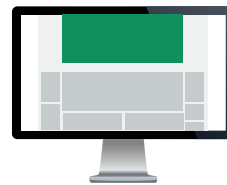
Billboard Size: 980x540 pixels