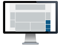
Side banner Size: 200x175 pixels