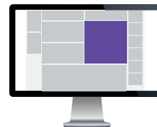
Campaign banner – Front page Size: 480x480 pixels