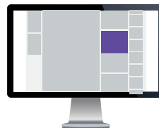
Campaign banner – Article Size: 300x250 pixels