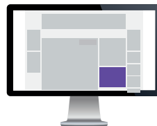
Campaign banner – Article Size: 300x250 pixels