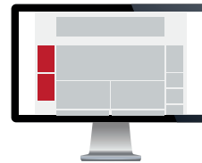
Sticky Banner Size: 240x400 pixels