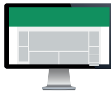
Topbanner Full Size Size: 1800x450 pixels