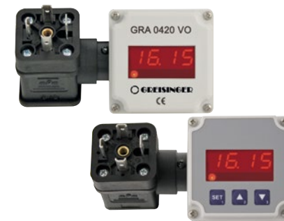
Version for dark light conditions GRA 0420 with LED display