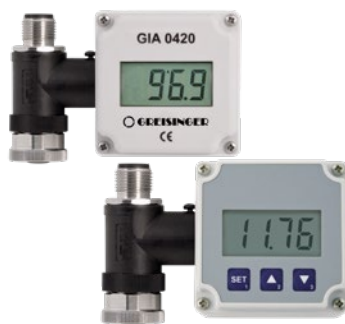
Versions with M12 plug connector GIA 0420-M12