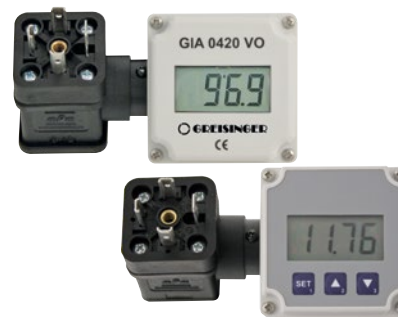
Versions with ISO valve plug GIA 0420-VO