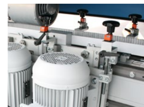
Separate height adjustment of each individual disc for quick compensation of tool wear