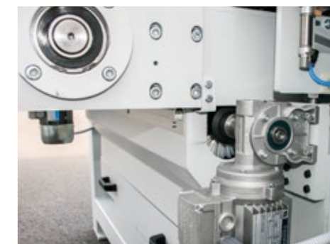
Rotating cleaning brush for feed belt (optional)