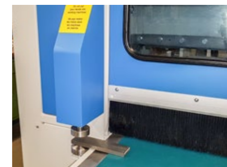
Motorized height adjustment, automatic setting of thickness using a limit switch (optional)