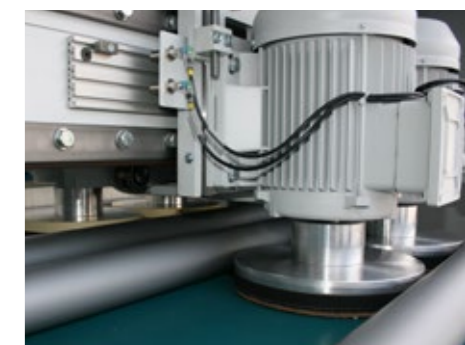
Four rotating discs with full-width oscillation for uniform 360° processing

This "disc only" concept makes it possible to dispense with expensive vacuum or magnetic hold down features and thus allows the machine to be priced competitively. Low energy consumption and inexpensive abrasive costs ensure a speedy return on investment.