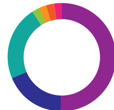
The distribution of readers according to position