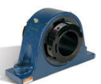
Two-Bolt Pillow Block

Choose the housing configuration that fits your need. For your convenience, Timken offers interchange solutions for hundreds of other housed units that simply don't offer the strength of these solid-block designs.