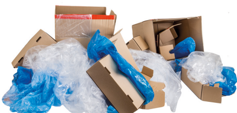
Waste from 10,000 die-cut lids.