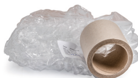
Waste from 25,000 Primoreels® lids.

Primoreels A/S Skimmedevej 10 DK-4390 Vipperød Denmark