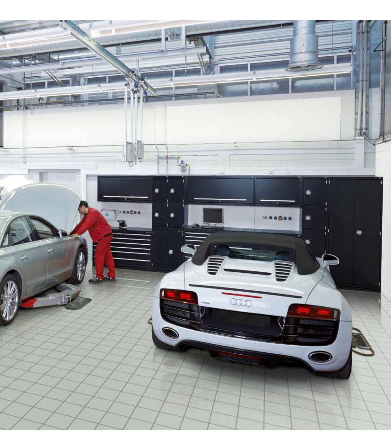
Quality in detail