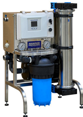
APRO SST 150