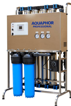
APRO SST 1000

The APRO-SST series systems are compact Home and Commercial reverse osmosis units that allow a consistent production of high-quality water with low energy consumption and reduced operational cost. Equipped with the highest quality components, APRO-SST series features robust space-saving design, easy maintenance, and quiet operation.