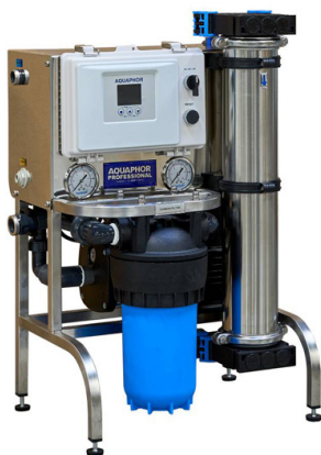
O SST 150