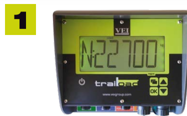
Instrument with high visibility display