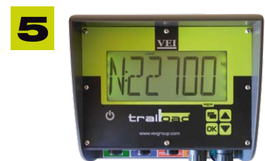
Optional weight repeater