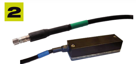
Load sensors to read suspension pressure or, depending on the application, axle-mounted sensors