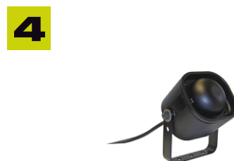
Optional load-end audible alarm