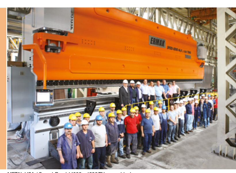
METAL USA / Speed-Bend 14200 x 1500 TN mono-block

We are confident in the support shown to customers in all aspects of our business starting from the quotation stage and continuing through-out the entire lifetime of your investment. We consider customer satisfaction to be a major priority and we will strive to keep this at the forefront of our development.