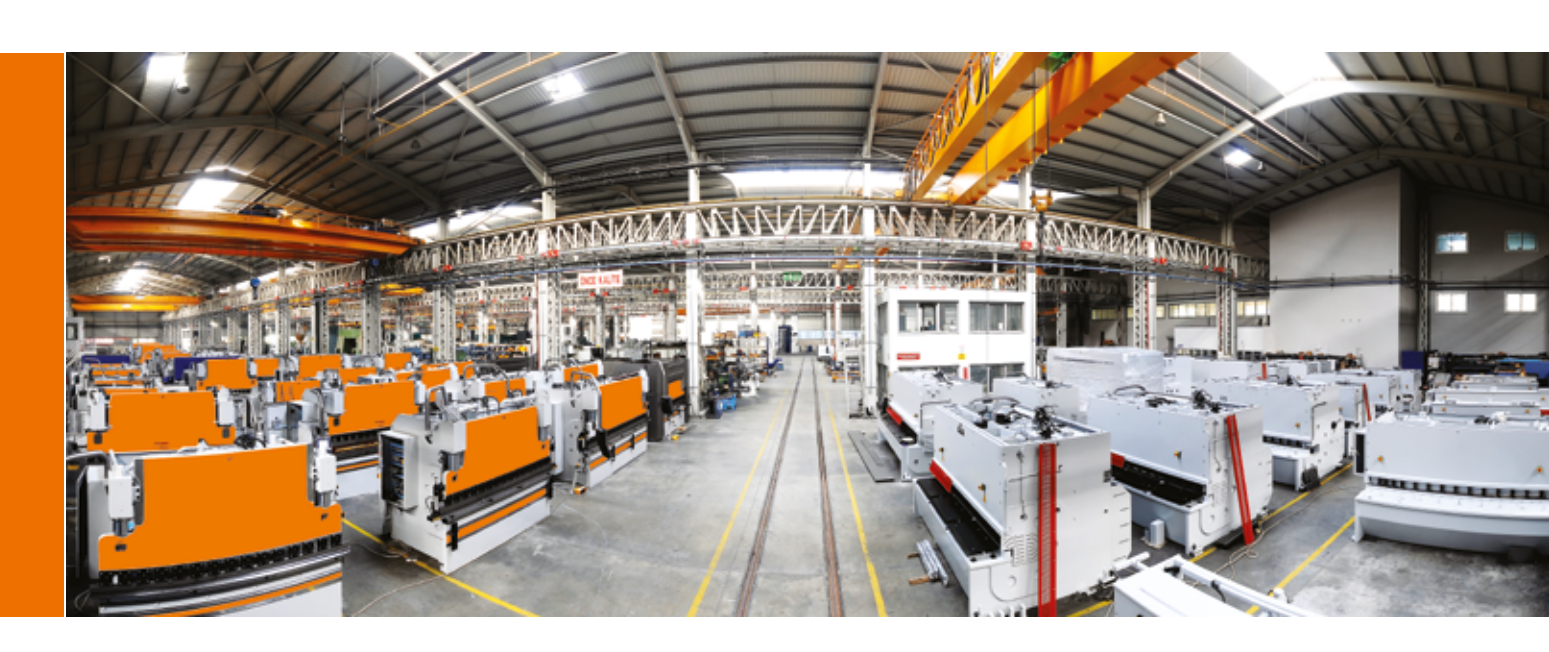
3.000 machines manufactured annually.