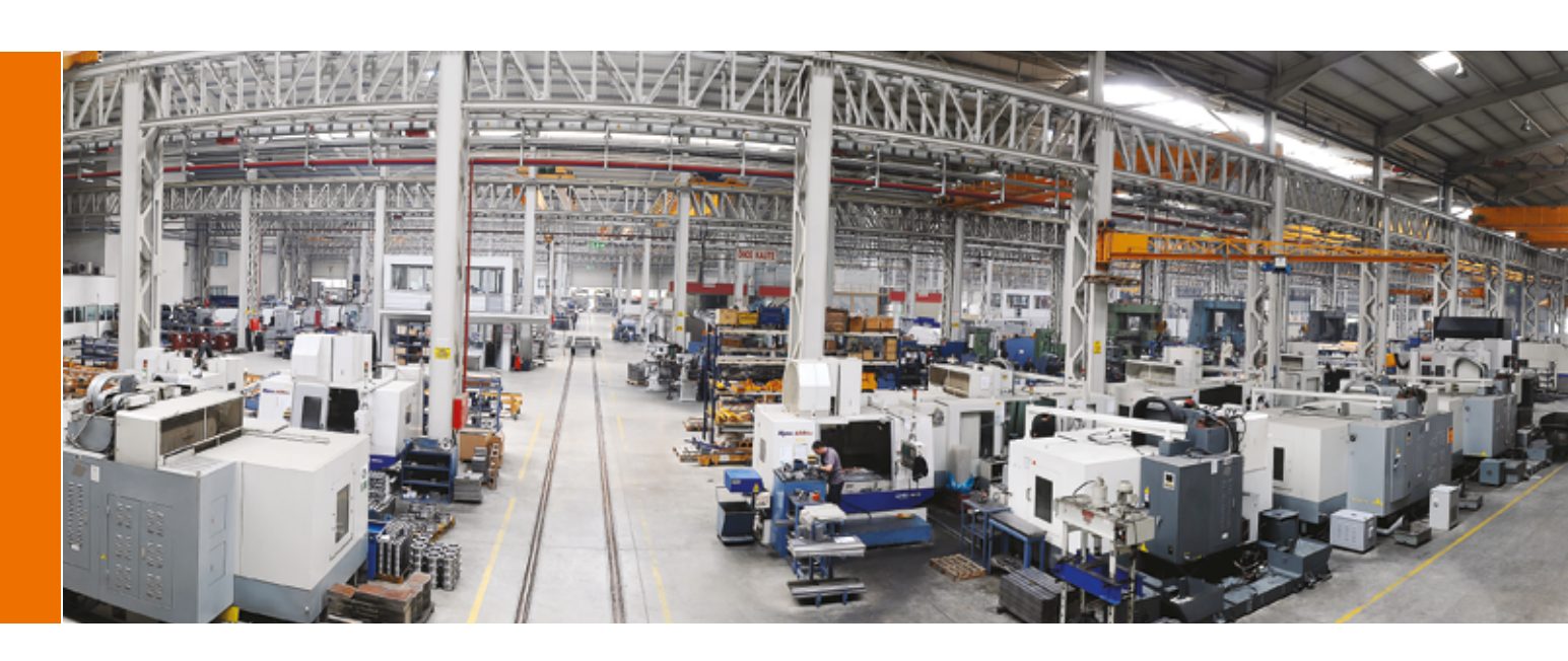
With 80.000 m<sup>2</sup> area, the biggest production plant under one-roof in its sector.