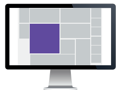
Campaign banner – Front page Size: 480x480 pixels