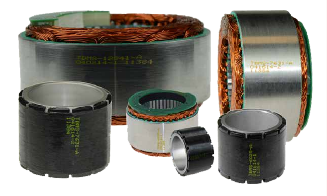
The TBM (Torquer Brushless Motor) series is designed for high-power, motion-critical applications such as robotic joints, medical robots, and sensor gimbals.

With so many factors potentially affecting the operation and lifecycle of robotic motors, robotics manufacturers that make collaborative robots require a flexible and durable solution. The TBM series is an innovative direct drive frameless motor technology provided by Kollmorgen.