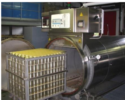
Highest requirements: Polystone® P SSAG layer pads must stand high temperature, pressure and steam in autoclaves used for the food sterilization process