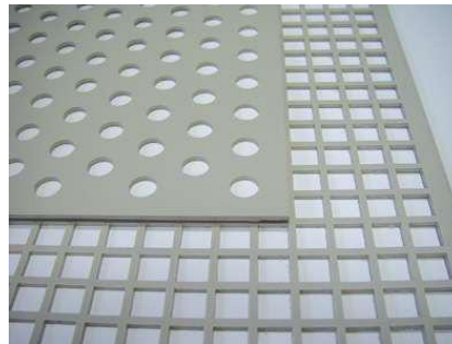
Flexibility: Round and square holes in different sizes and pitches are possible

We offer to you our experience in perforation. From the initial idea to the final specification, we will be your partner with the design offering our advice.