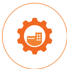
HVAC & BYGNINGS- AUTOMATIK