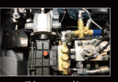
High pressure washing