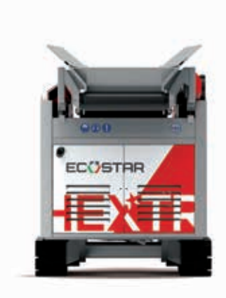
Hextra track version