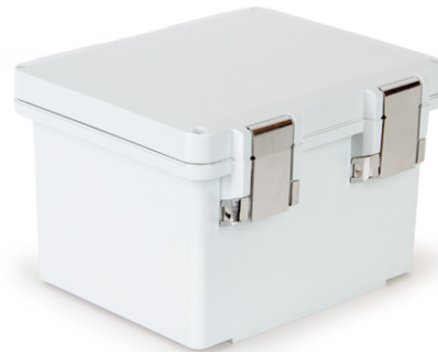
Hinged, Metal Snap Latch (HML)