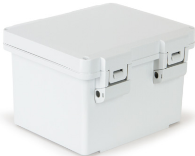
Hinged, Nonmetal Snap Latch (HNL)