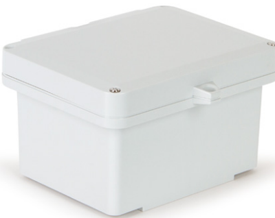
Hinged 2-Screws, Padlock Clamp (HS)