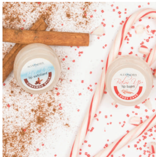
HOLIDAY BALM UP™ AND BUFF UP™

All the benefits of our traditional Balm & Buff Up™ flavored for the holidays in Candy Cane and Cinnamon Stick.