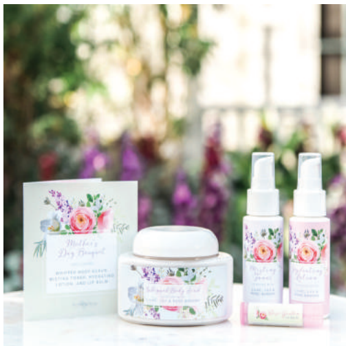
MOTHER'S DAY BOUQUET

This seasonal favorite is a luxurious set of exfoliating, toning, and hydrating products infused with Lilac, Lilly, and Rose oils! The Mother's Day Bouquet includes a whipped body scrub, toner, moisturizer, and lip balm.