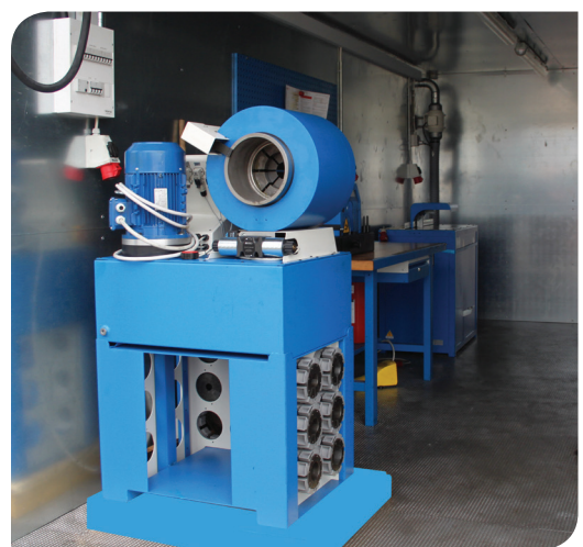
Manufacturing of MED certified hoses.