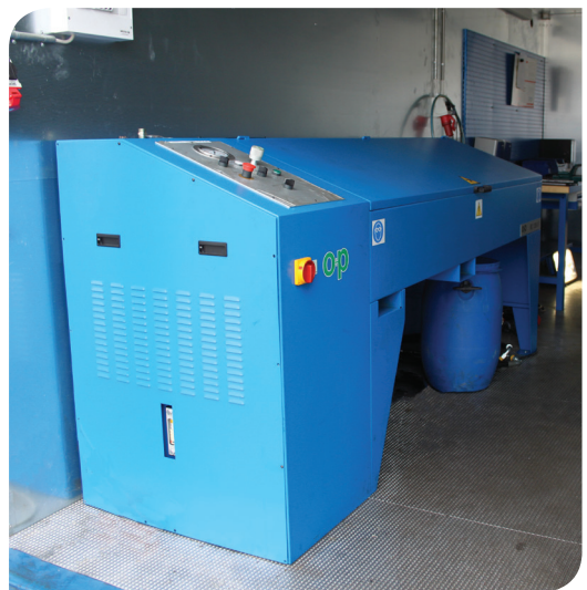
Pressure testing bench up to 1,200 bar with hydraulic fluid.

The hoses are supplied with MED certificate, pressure test certificate, and a customised hose list. We provide tagging of hoses and deliver low frequency chip, if required.