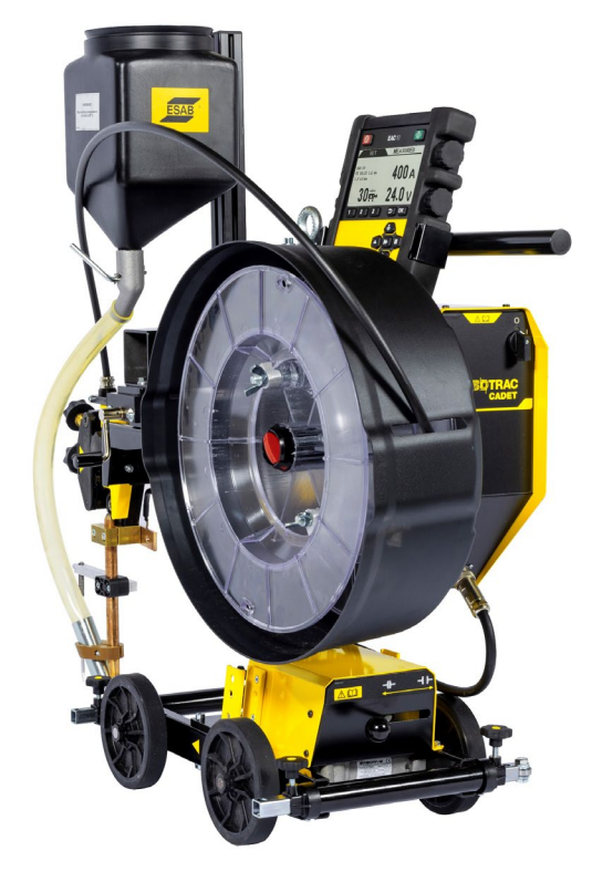
Versotrac Cadet single wire