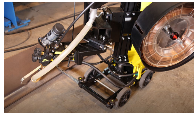
Versotrac Cadet is the ideal tractor for fillet welds.