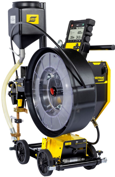
Versotrac Cadet single wire

For more than 70 years ESAB has designed welding tractors to make submerged arc welding easier and faster. The Versotrac Cadet is the newest addition to the family designed for SAW automation.