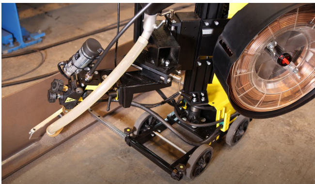
Versotrac Cadet is the ideal tractor for fillet welds.