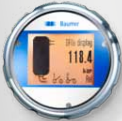
Red = take action