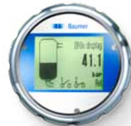
Tank visual (tank/bottle)