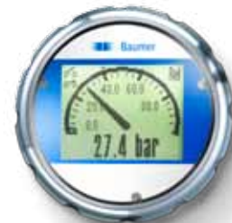
Analog (with/without value)