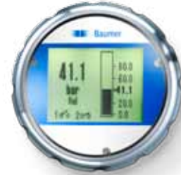
Bar graph (vertical/horizontal)