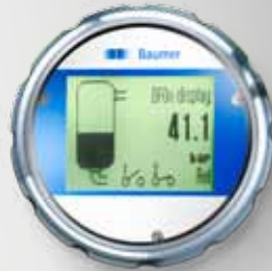
Green = ok

Why waste more than a second determining whether you need to take action?