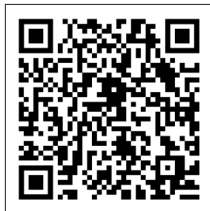
USB power bank