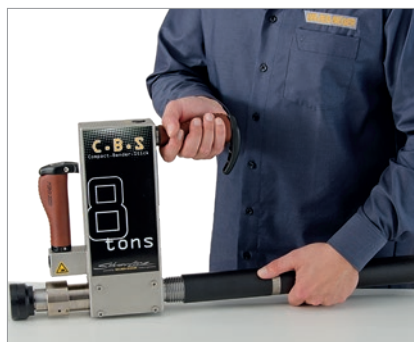
Screwing in the extension