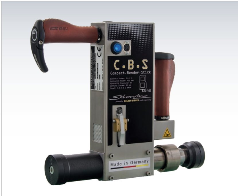
Compakt Bender Stick C·B·S

The Compact Bender Stick C·B·S is a small battery-powered hydraulic press. Weighing less than 10 kg, this universal tool can find its place both in the workshop and at the construction site. The main task of the C·B·S is to move, position parts, straighten or adjust railings or frames, bend tubes, fold flat iron or round material with a force of 8 tons and a stroke of 85 mm. This small press has an incredible number of applications and we are continuously developing them. The C·B·S can perform up to 150 strokes on a single charge. It can be operated vertically and horizontally thanks to its two handles and two control buttons.