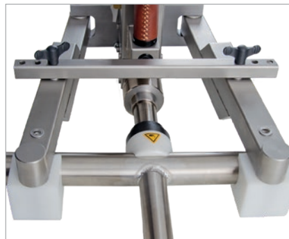
Straightening a top chord