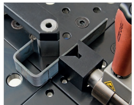
Folding 60x8 mm flat iron 60x8 mm