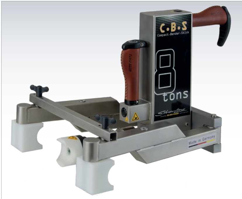
C·B·S with optional straightening-bending device for tubes and profiles

The universal Compact Bender C-B-S can be equipped with a straightening-bending device. The changeover to tube and profile processing is very simple and can be carried out in a few seconds without tools. With this equipment you now have a 15 kg device in your hand which you can use to bend railings and adjust railings at the construction site. But you can also straighten tubes or correct after distortion during welding.