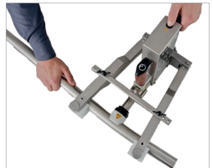
Bending 42 mm tube