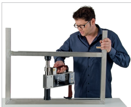
Smallest distance 325 mm