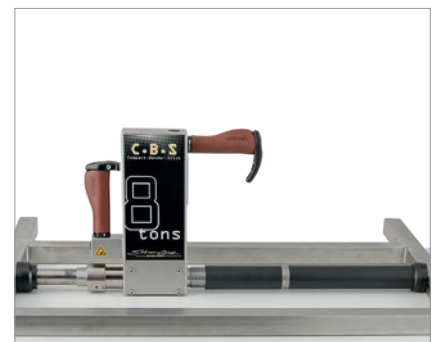
Straightening with extension