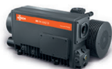
R5 RA 0302 D

S/N : CHM120160150 IMEI: 485793894038294 Oil type: VM100 Operating frequency: 60 Hz Application type: Packaging Gasballast: Open Contract type: Advance