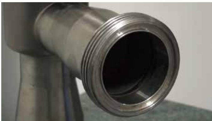
Normal View Item looks clean and normal under white light or standard UV

Industry compliant Bactiscan™ conforms to GMP and CIP requirements with an IP67 rating and is drop test certified to 1.5 meters.