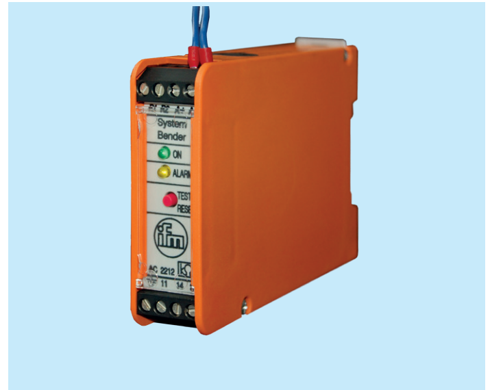
ASi line insulation monitor

The application range is limited to isolation monitoring in non-earthed ASi and 24 DC voltage networks (IT system). Active symmetrical and passive measuring technique, 2 signalling contacts. Contact 11/24 is triggered by symmetrical faults and asymmetrical faults. Contact 11/14 is triggered additionally by asymmetrical faults. The contacts are closed when the ASi voltage is applied and there is no fault.