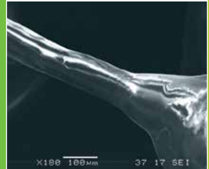
Other Floor Pad fibres

Larger, stiffer fibres are randomly coated on surface areas only, providing fewer contact points with the floor and inconsistent results.