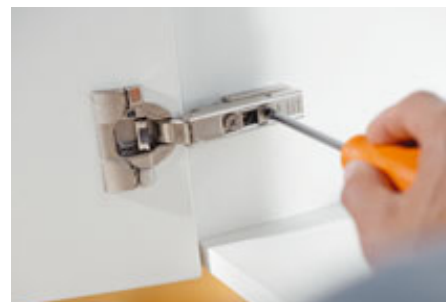
3-Dimensional adjustment is easily achieved to allow uniform gaps