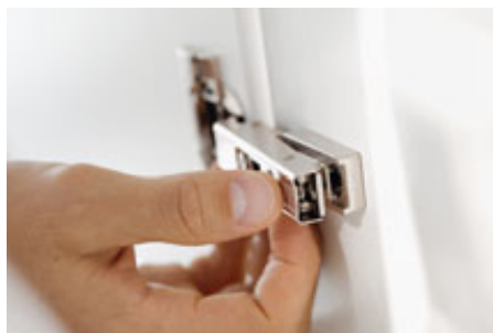
Tool-free, quick and easy – that's the CLIP assembly method.