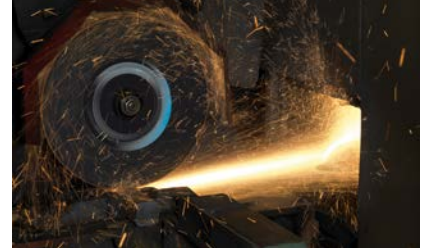
Application: Chop cut

Competence in cutting and grinding - this is what has distinguished Tyrolit for more than one hundred years. Our extensive know-how in the development of cut-off wheels makes us the market-leading supplier in the steel industry. The innovative design of the SECUR EXTRA THIN enables a further reduction of the wheel thickness by up to 20% compared to the SECUR SUPER THIN cut-off wheel and by 36% compared to the SECUR cut-off wheel.