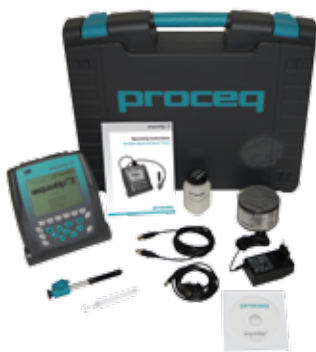
353 10 100 unit D

Equotip3 indicating device, AC adapter, carrying case, USB-cable, Equotip CD, operating instructions and quick reference guide. The customer needs to buy the appropriate impact device and test block in addition to the Equotip 3 basic unit