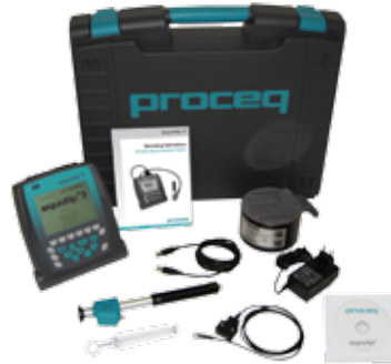
353 10 300 unit G