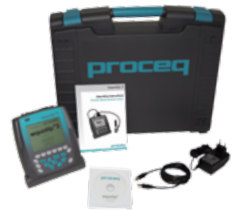
353 10 050 basic unit