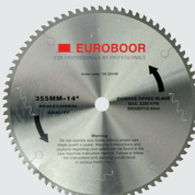
Sawblade 80 teeth 130.355/80