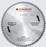
Sawblade 66 teeth 130.355/66