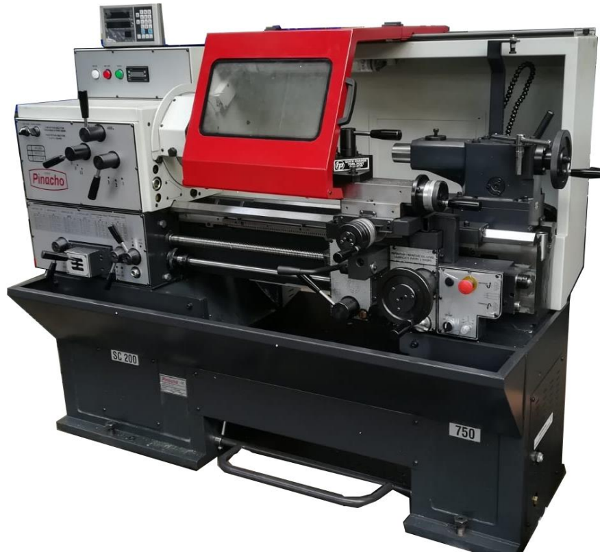
*Picture of model ML-18 / 200x750