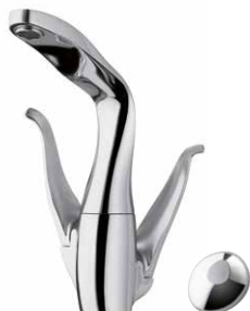
ORAS 8222F, ORAS 8225F

Alessi Swan by Oras, kitchen faucet. Alessi Swan by Oras, kitchen faucet with a smart dishwasher valve.