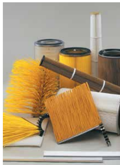
In addition to turbine parts, we also provide filter cartridges, new dedusting and sealing brushes and customized rubber and manganese blanks for several types of machines.

Quick processing of your orders and a smooth transfer to the warehouse ensures fast and professional shipment of ordered items.