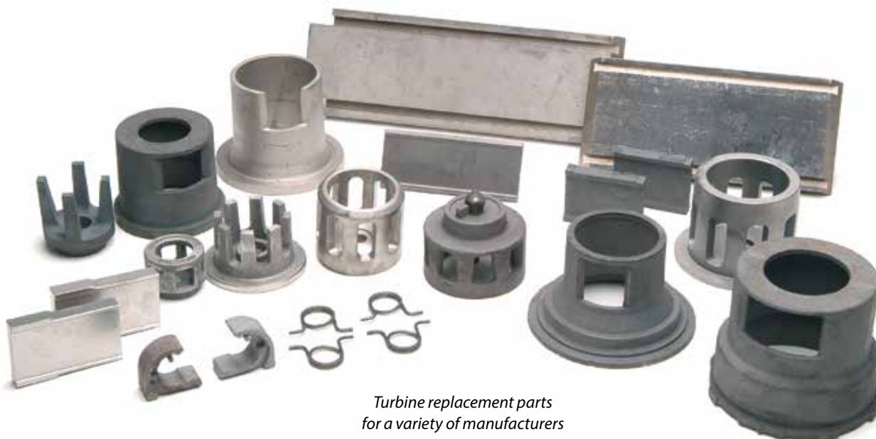
Turbine replacement parts for a variety of manufacturers