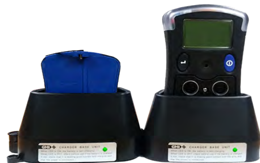
Long duration battery pack and instrument with fast charge battery pack, charging in Fast Charger master / slave units.

As an ISO 9001 approved company, Gas Measurement Instruments quality assurance programmes demand the continuous assessment and improvement of all GMI products. Information in this leaflet could thus change without notification and does not constitute a product specification. Please contact GMI or their representative if you require more details.