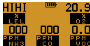
Display in alarm conditions