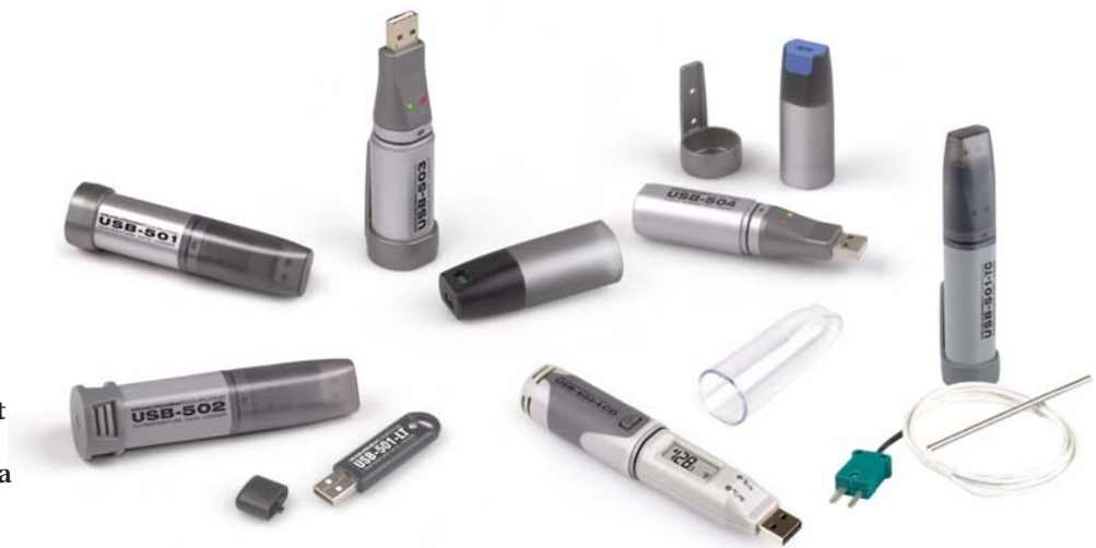
USB-500 Series data loggers offer low-cost, stand-alone data collection for temperature, humidity, voltage, current, or event/state change