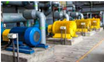
Plant / Equipment Installation