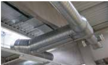
Mechanical / Plumbing