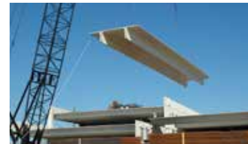
Prefabricated / Modular